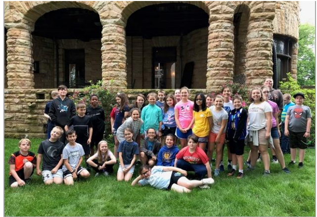
An afternoon exploring the historic Kilmer Mansion

The JIM BRYDEN MEMORIAL SCHOLARSHIP program provides funding for college-bound students interested in architecture, art, history, preservation, urban studies and urban planning, as well as any other major related to historic preservation.