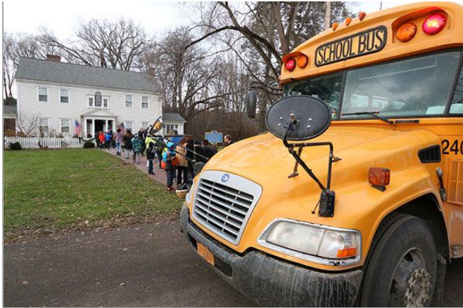
Fourth-grade students tour the 1799 Washingtonian Hall

The HISTORY IN YOUR BACKYARD Field Trip Grant Program is for school groups K-12. Awards of $200 each are available to supplement field trips focused on places of historic, architectural and/or cultural significance within Broome and Tioga Counties of New York.