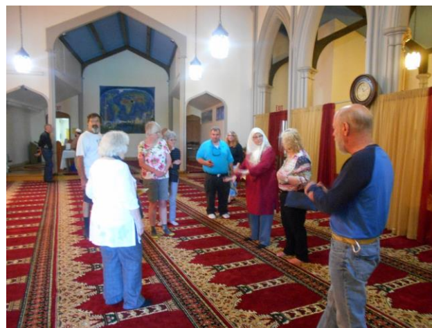
Islamic Awareness Center, Binghamton