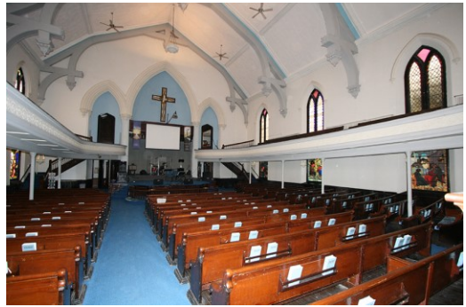
Landmark Church, Binghamton

The Annual Presentation of Historic Preservation Awards is coming in June. If you know of any recent examples of historic preservation, please consider submitting a nomination – just go to <u>www.pastny.org</u> to submit a recommendation on-line.