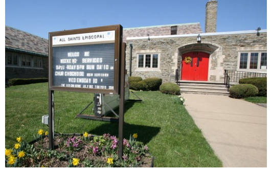
All Saints Episcopal Church, Johnson City