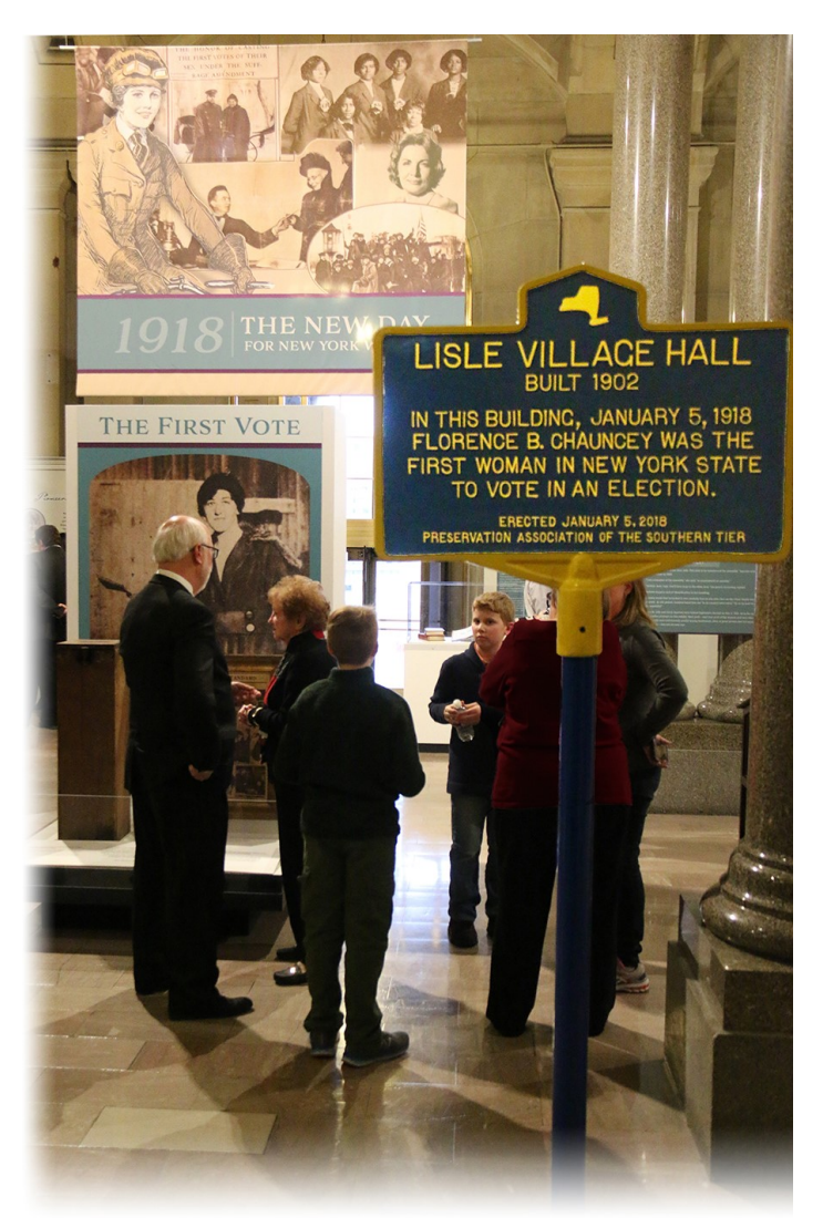
Exhibit at the New York State Capitol in Albany