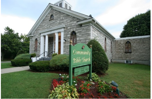
Community Bible Church, Binghamton