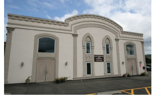
Islamic Organization of the Southern Tier, Johnson City