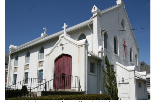
Redeemer Lutheran Church, Binghamton