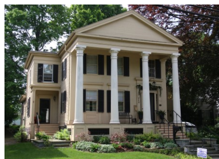
Historic Preservation Award Restoration and Elevation of 1840 Home, Main Street, Owego