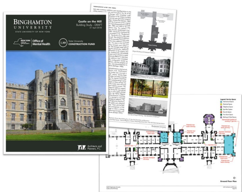
Castle on the Hill Building Study

This year PAST has actively monitored the progress of a “Building Study,” commissioned by Binghamton University to determine the current condition of the building, identify what needs to be done to stop further deterioration and prepare it for rehabilitation and reuse, and establish associated cost estimates.