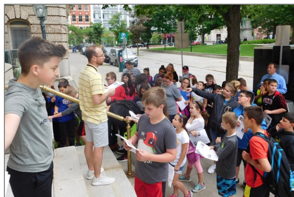
Old City Hall – built 1905

This walking tour was the first step of a new program by PAST's Education Committee to develop an historic preservation educational package for area schools. More information on this exciting new program will be available soon.