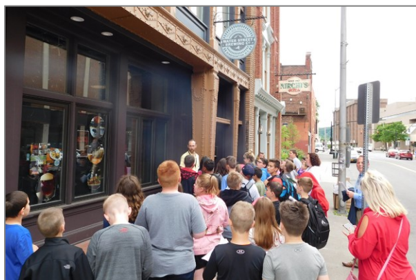
The Peoples Theater – Silent Movie House, built 1912

After visiting over a dozen sites, complete with descriptions and fun facts provided through CLIO, the students finished at the Broome County Public Library with a brief presentation on the newest Kilmer exhibit, and a personal tour of the Broome County Historical Society archives.