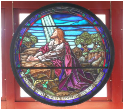
Memorial window at Northminster Presbyterian Church, Endwell

The sites are grouped in clusters along specific streets, neighborhoods or downtown areas. In this way, visitors can select groups of sites to visit that may be in walking distance of each other. Sites will welcome visitors, give tours, sing hymns, perform musical recitals, explain architecture, stained glass windows and tell the history of their building and congregation. Several sites also inform visitors about social and community activities that take place at the site outside of the religious service. The Sacred Sites Committee would like to invite everyone to this very important event and thank all the participants for their willingness and efforts to be included in this year's Sacred Sites Open House. The 2016 Sacred Sites are: