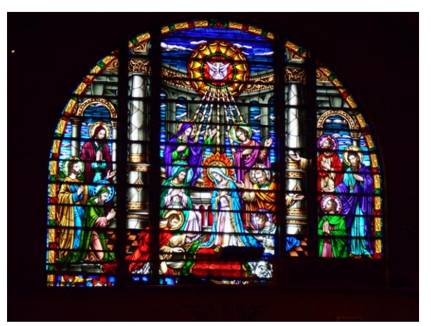
Stained glass window depicts Descent of the Holy Spirit on Pentecost at Holy Spirit, Byzantine Catholic Church Binghamton

The third annual Sacred Sites Open House Sunday was held on Sunday, May 17, 2015. This year included twenty sacred sites in Binghamton, Endicott, Endwell and Johnson City. This was a state-wide event sponsored by the New York Landmarks Conservancy and co-sponsored locally by the Sacred Sites Committee of PAST. Various architectural styles, including Gothic, Romanesque, Byzantine and Modern were featured at the sites along with guided tours and photo displays. The Sacred Sites Committee wishes to thank all the participating sacred sites, pastors and volunteers who gave their time to make this event a success.