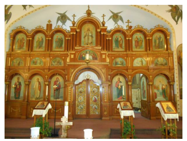
Iconostasis (icon screen) at Dormition of the Virgin Mary Orthodox Church, Binghamton