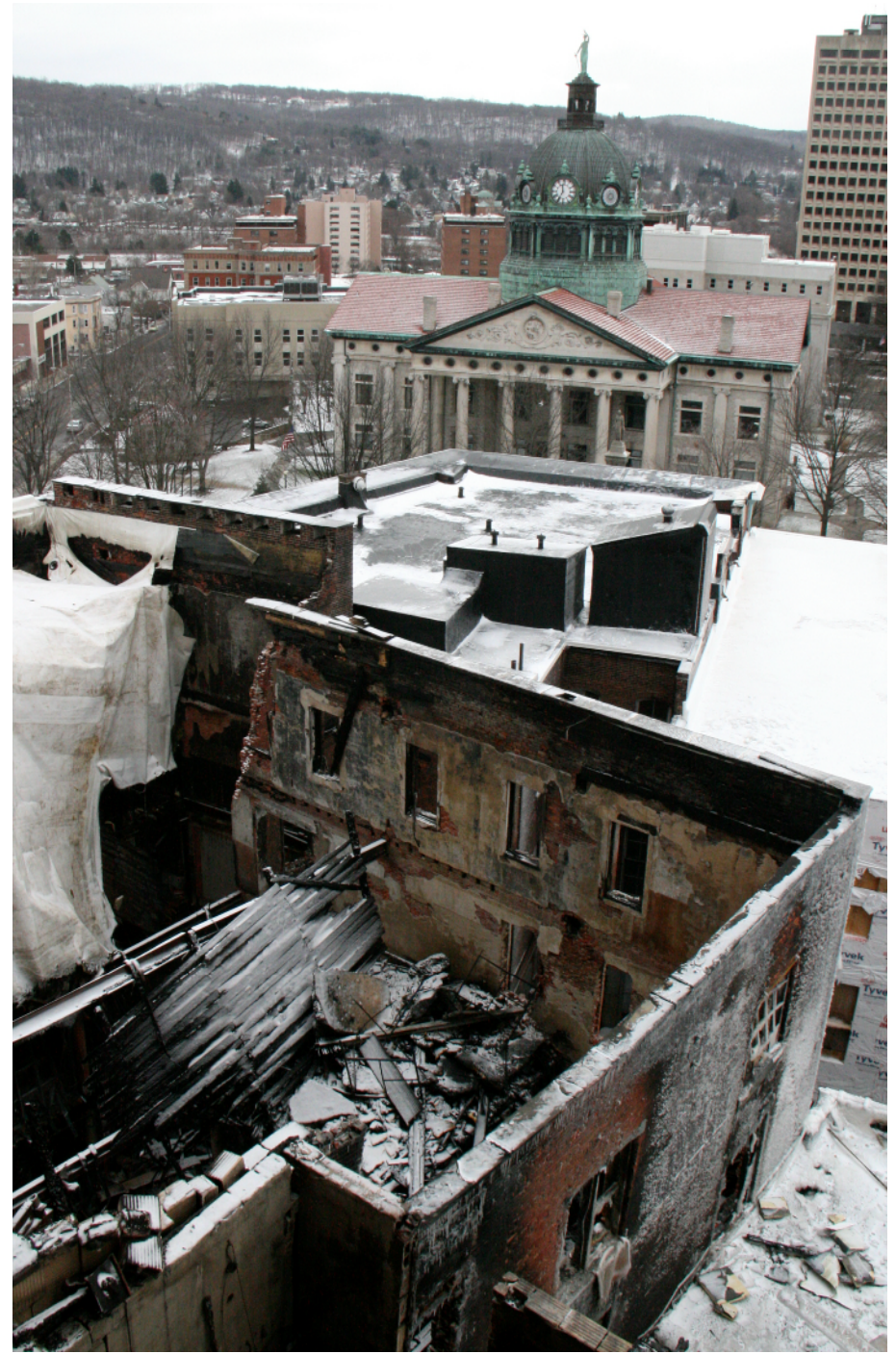
The fire-ravaged Cyrus Strong Building as viewed from the neighboring Press Building. The roof of the 1876 cast iron Perry Building can be seen at the center of the photograph.

It is only through the outstanding efforts of City firefighters that the fire was contained and did not spread to other structures within the Court Street Historic District.