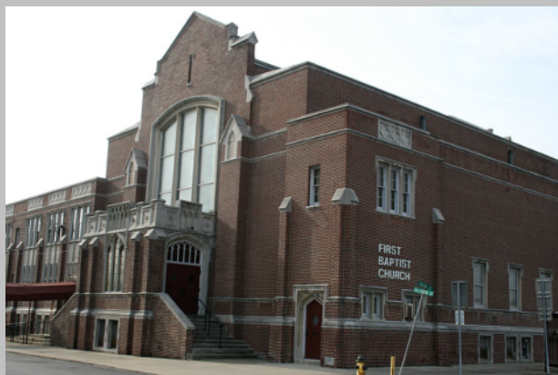
First Baptist Church of Johnson City prior to demolition.