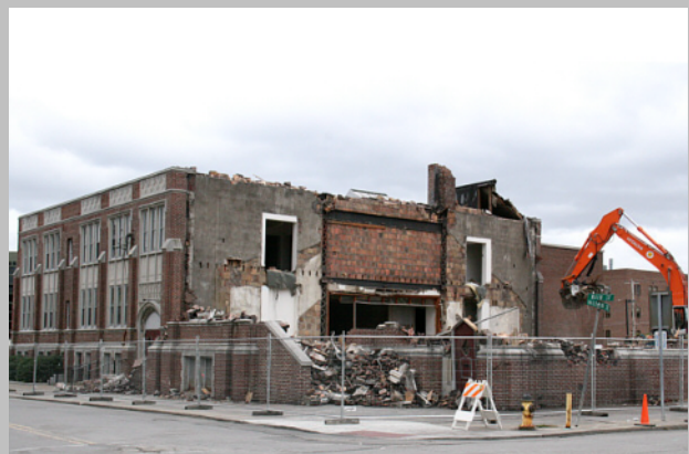
Demolition in progress, September 17, 2010.

See photos of the demolition at http://nysLandmarks.com/jcbaptist